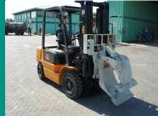
8 X FORKLIFT JJCC 2.5 TON WITH VARIOUS HANDLING ACCESSORIES