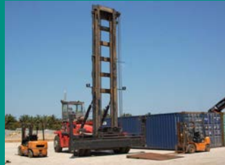
1 X KALMAR EMPTY HANDLER