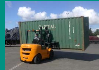
2 X FORKLIFT JJCC 5.0 TON