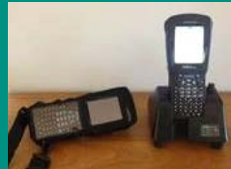
PSION HANDHELD DEVICES