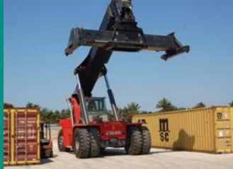
2 X KALMAR: DRF450-60S5