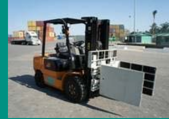
6 X FORKLIFT JJCC 3.0 TON