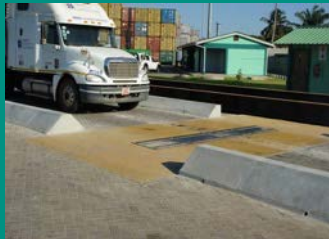
1 X AXLE SCALE FOR LOAD DISTRIBUTION CHECKS