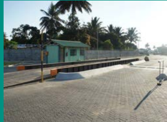
1 X 22M WEIGHBRIDGE